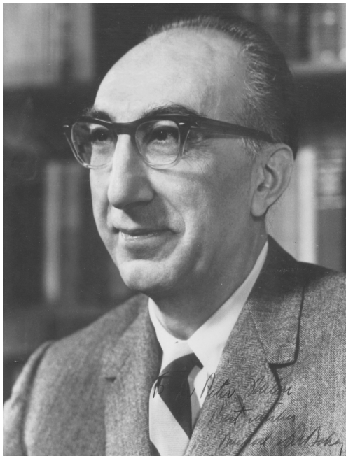
Dr Michael DeBakey

Although stenting of the carotid artery is available it is yet to be shown that it is better surgery after three international trials. You